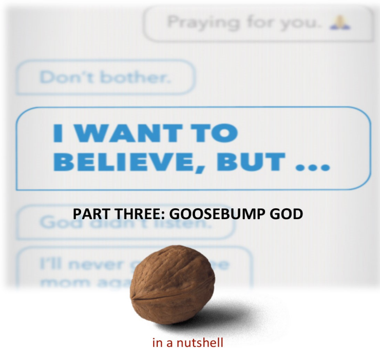
in a nutshell