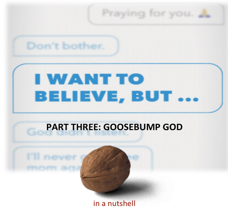
in a nutshell

This can be a situation where we may try to corner God. We try to force Him to make decisions and we provide Him with the multiple choice answers. We may set up a scenario and say, “If the light turns green before I reach the intersection, Your answer is yes.” This can really get us in trouble. Sometimes I remind people that they aren’t Moses. God gave him a burning bush and spoke to him audibly. So sometimes we may think that everything God did with his chosen prophets and leaders, He should do for us. You’re not Moses, Joshua, Samuel, David, Jesus or Paul. Yes, God spoke to them and showed them signs, but it doesn’t mean He will interact with every person that way. Don’t assume you can “put out a fleece” and see God work with you like he did with Gideon. (Judges 6)